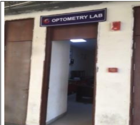
Optometry Lab 526

3 state of the art laboratories for students training. in Optometry Glimpse of the labs Infrastructure