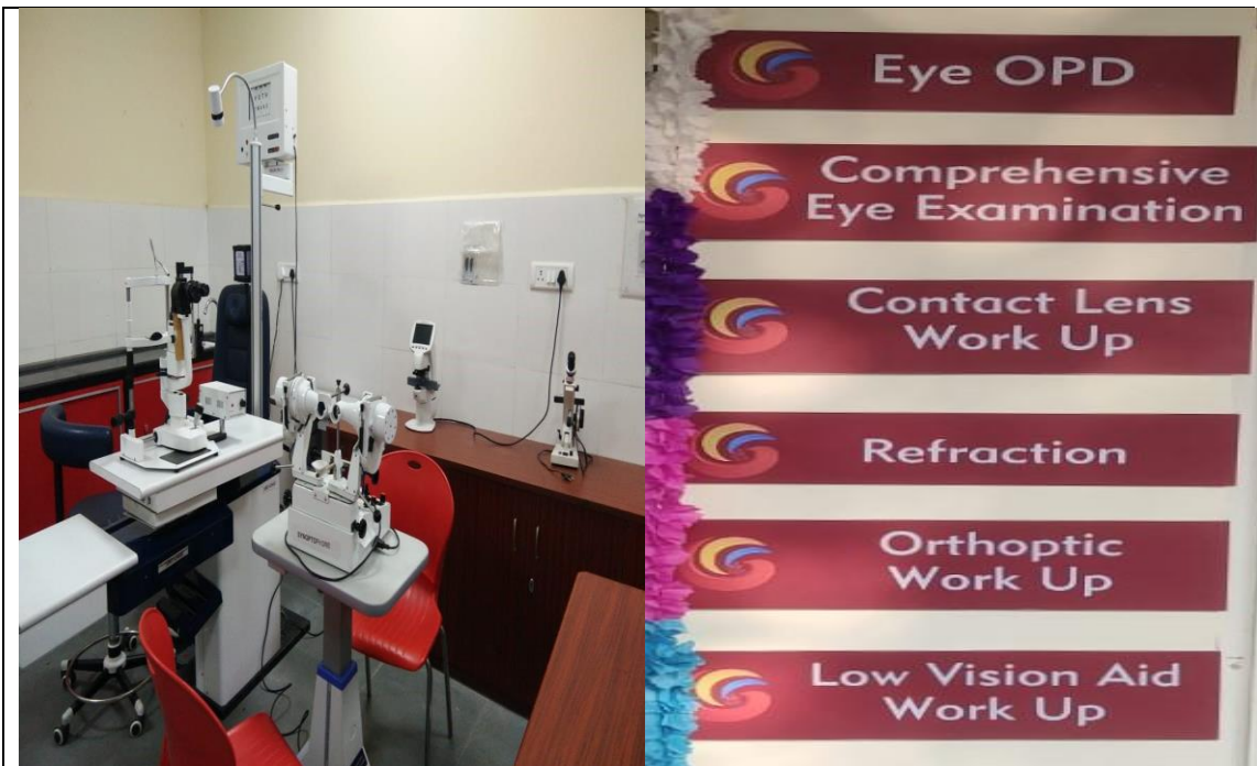
Consultant Room Eye OPD