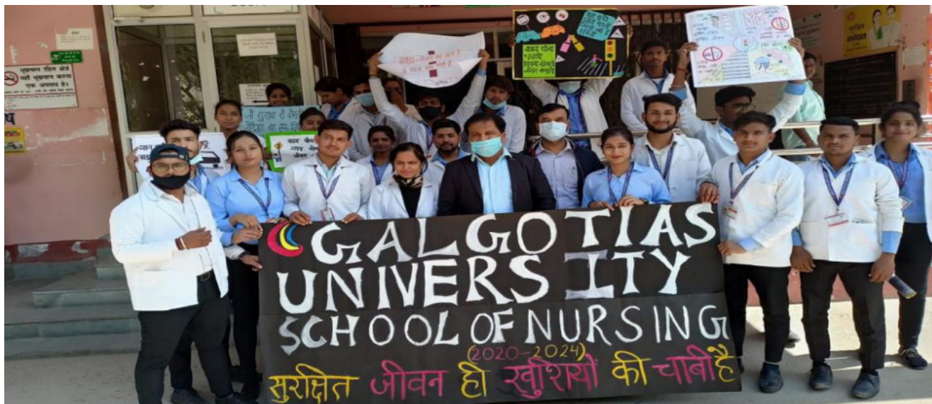
Cancer Awareness Rally