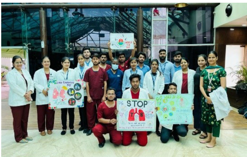
Awareness Program conducted by B.SC. Nursing students at Fortis Hospital Noida 62