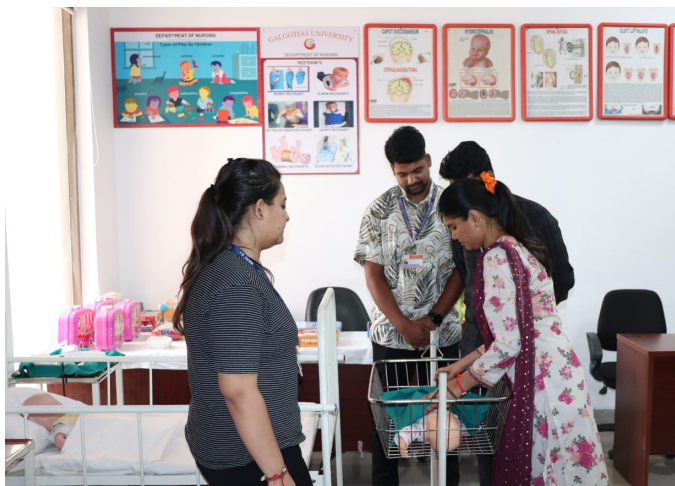
Faculty demonstrating the newborn examination in Child Health Nursing Laboratory.