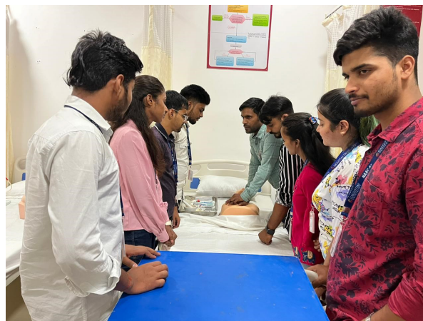
Faculty demonstrating advance procedure Basic Life Support in Simulation Laboratory.