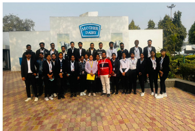
Educational Visit of B.Sc. Nursing 3rd Year students at Mother Dairy Visit, Noida