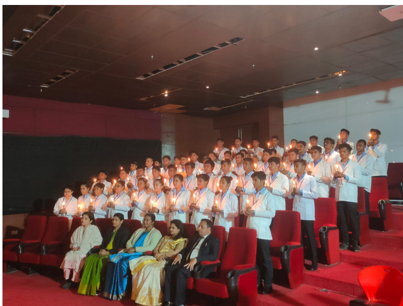
Oath taking and Lamp Lighting ceremony for B.Sc. Nursing First Semester students every Year