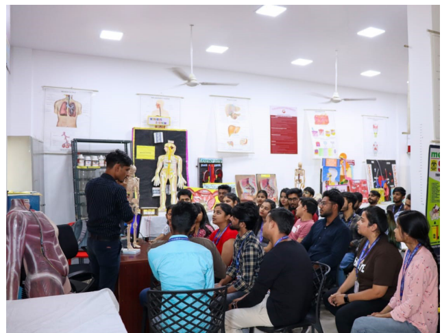
Faculty teaching the Anatomy and Physiology of different body parts in Pre- Clinical Science Laboratory.