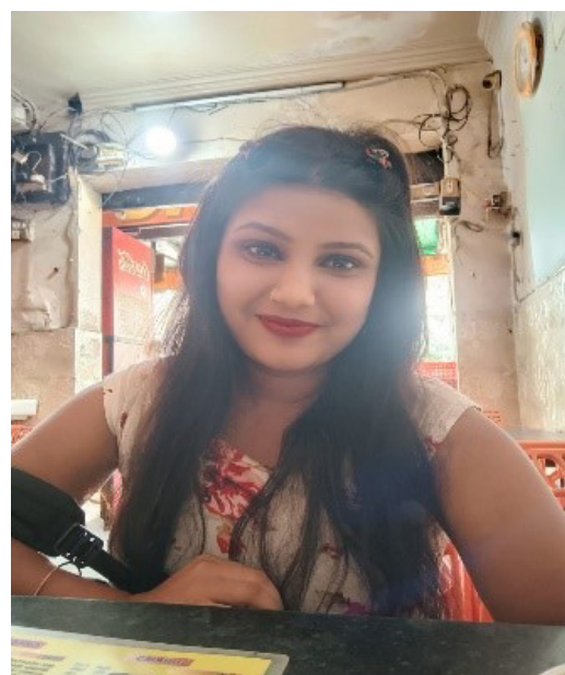
Trained Nurses Association of India offers student nurses association (SNA) Scholarship every year.