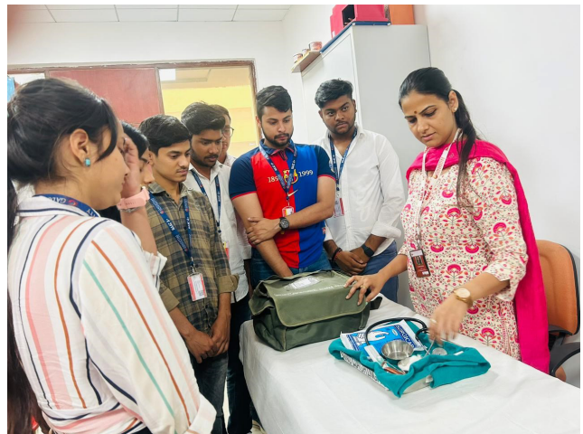
Faculty explaining the community bag technique procedure in Community Health Nursing Laboratory.