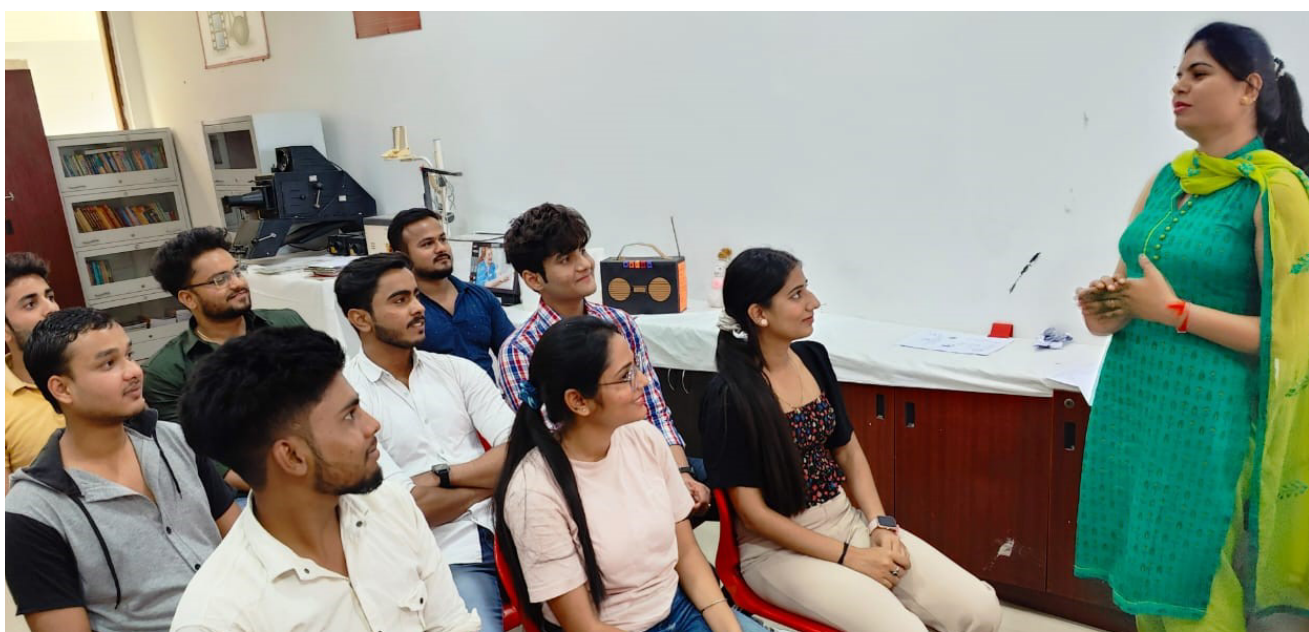
Faculty Explaining the projectile methods of Audio Visual Aids in AV Aids Laboratory.