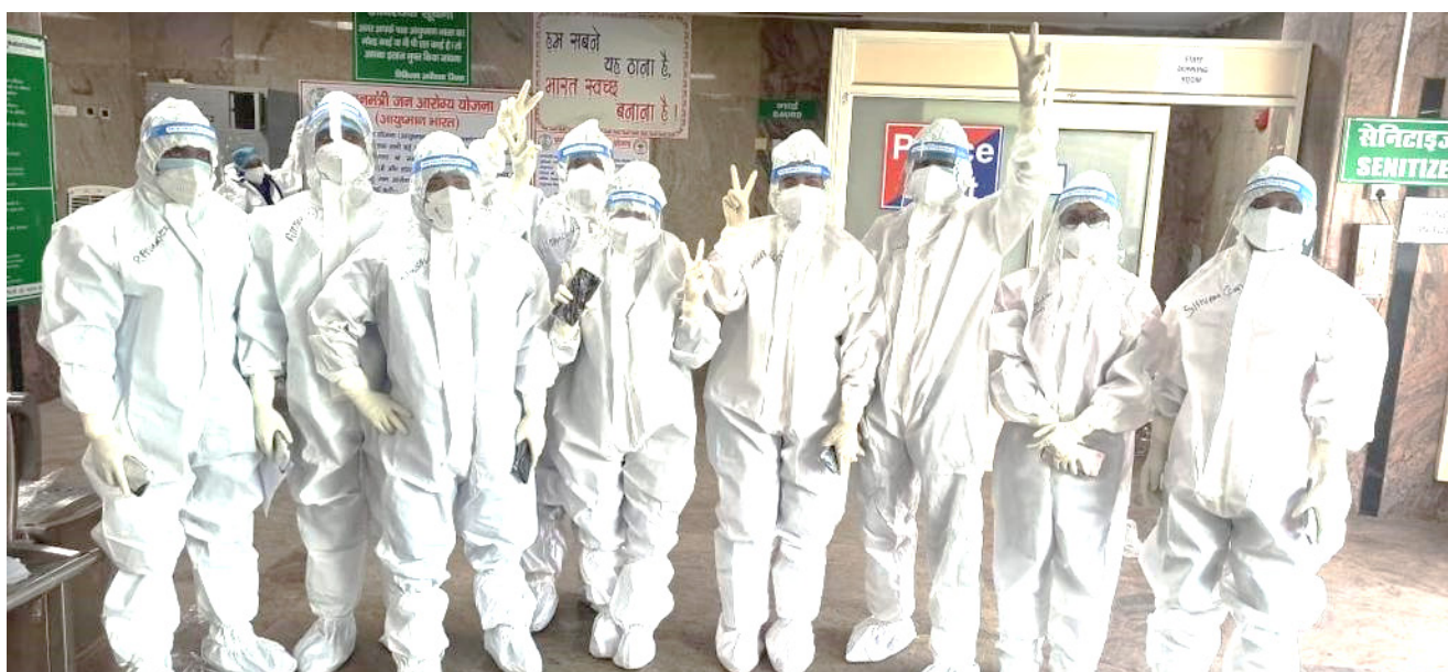
Galgotias School of Nursing students worked as a COVID 19 warrior during the pandemic period