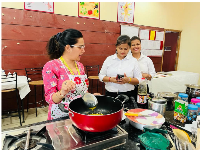
Faculty as well as students preparing the diabetic diet for community people in Nutrition Laboratory.