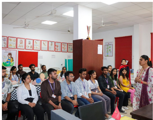
Faculty explaining the mechanism of Labor in Obstetrics and Gynaecology Nursing Laboratory.