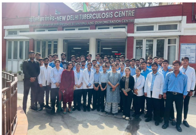
Educational Visit of B.Sc. Nursing 2nd Semester students at New Delhi Tuberculosis Centre, New Delhi