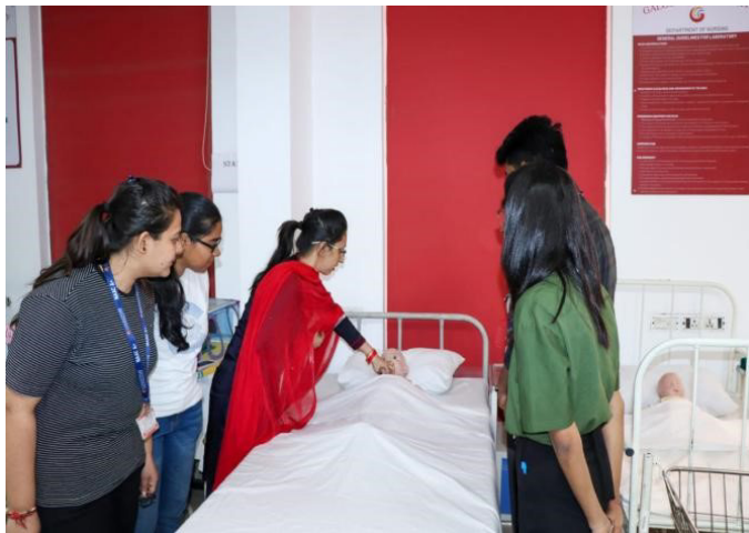
Faculty demonstrating the Cardiopulmonary Resuscitation (CPR) and Automated External Defibrillator (AED) to the B.Sc. Nursing students in Nursing Foundation including Adult Health Nursing and Advanced Nursing Laboratory