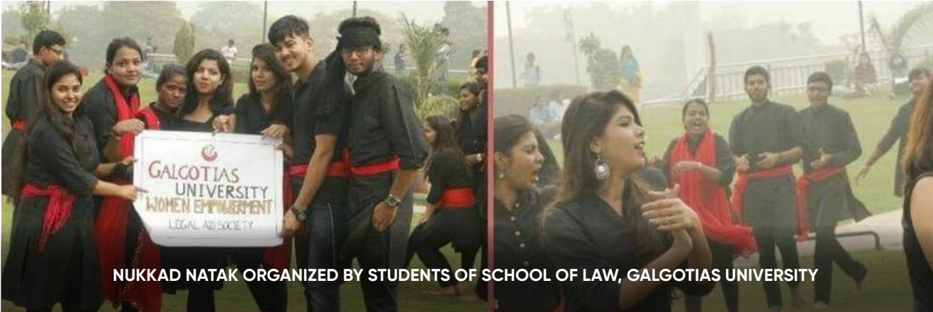
NUKKAD NATAK ORGANIZED BY STUDENTS OF SCHOOL OF LAW, GALGOTIAS UNIVERSITY