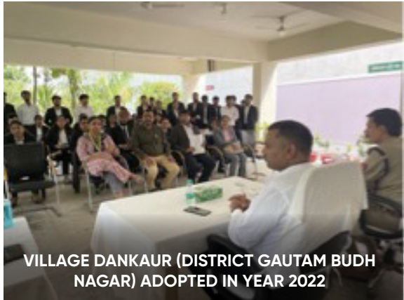
VILLAGE DANKAUR (DISTRICT GAUTAM BUDH NAGAR) ADOPTED IN YEAR 2022