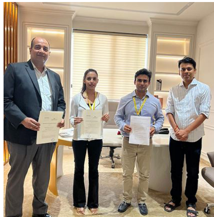
AN MOU WAS SIGNED BETWEEN SCHOOL OF LAW, GALGOTIA'S UNIVERSITY AND SCRIBOARD (ADVOCATES AND LEGAL CONSULTANTS)