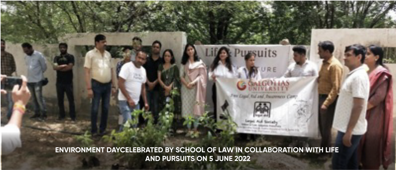
ENVIRONMENT DAY CELEBRATED BY SCHOOL OF LAW IN COLLABORATION WITH LIFE AND PURSUITS ON 5 JUNE 2022