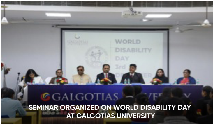
SEMINAR ORGANIZED ON WORLD DISABILITY DAY AT GALGOTIAS UNIVERSITY