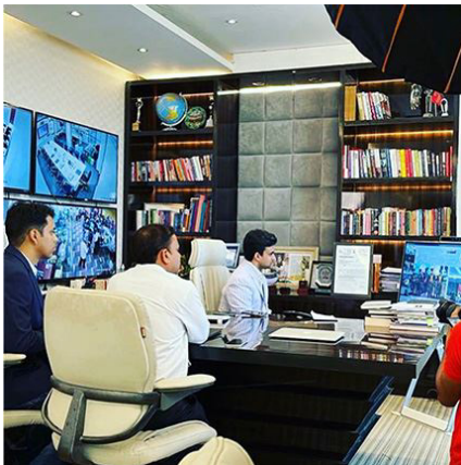
AN MOU WAS SIGNED BETWEEN SCHOOL OF LAW, GALGOTIA'S UNIVERSITY AND UNIVERSITAS NEGERI SURABAYA, INDONESIA