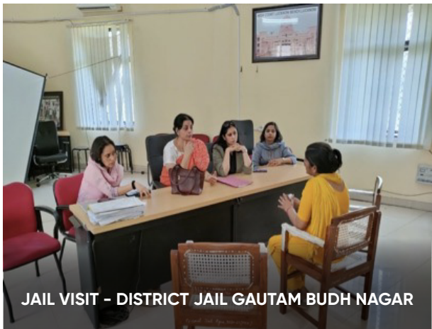
JAIL VISIT - DISTRICT JAIL GAUTAM BUDH NAGAR