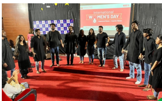
Women's Day Celebration Campus Auditorium

By creating a space for dialogue, advocacy, and action, Galgotias University fosters a supportive environment where women uplift one another and drive meaningful societal transformation. This initiative not only celebrates progress but also reaffirms the university's dedication to empowering women, ensuring they become trailblazers in innovation, leadership, and sustainable development.