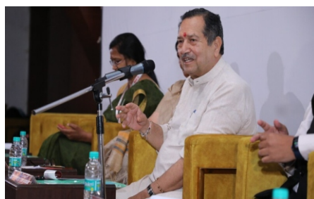
Rashtriya Suraksha Jagran Manch School of Liberal Education

This initiative marks a crucial step in closing the gender gap and ensuring equal opportunities for all.