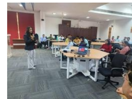
Expert Session Collaborative Classrooms

The event featured industry experts, HR professionals, and career coaches, delivering sessions on resume building, interview skills, workforce expectations, and personal branding. A keynote address by a renowned career expert emphasized adaptability, proactive career planning, and skill development. Interactive workshops on financial literacy, entrepreneurship, and leadership further enriched the participants' understanding of professional growth.