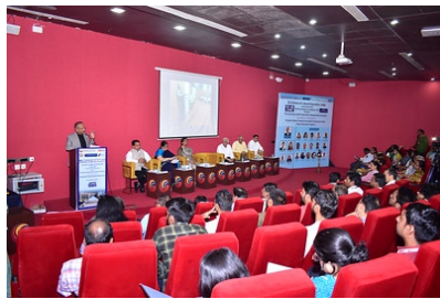
ICPATME 2023 : Conference on Education & Technologies Campus Auditorium

The outcome of this initiative was a heightened understanding of gender dynamics, policy awareness, and proactive engagement in fostering equality. By equipping students with the tools to recognize and address gender-based issues, the university advances its mission of creating a just, respectful, and inclusive academic space, aligning with Sustainable Development Goal 16 (SDG 16).