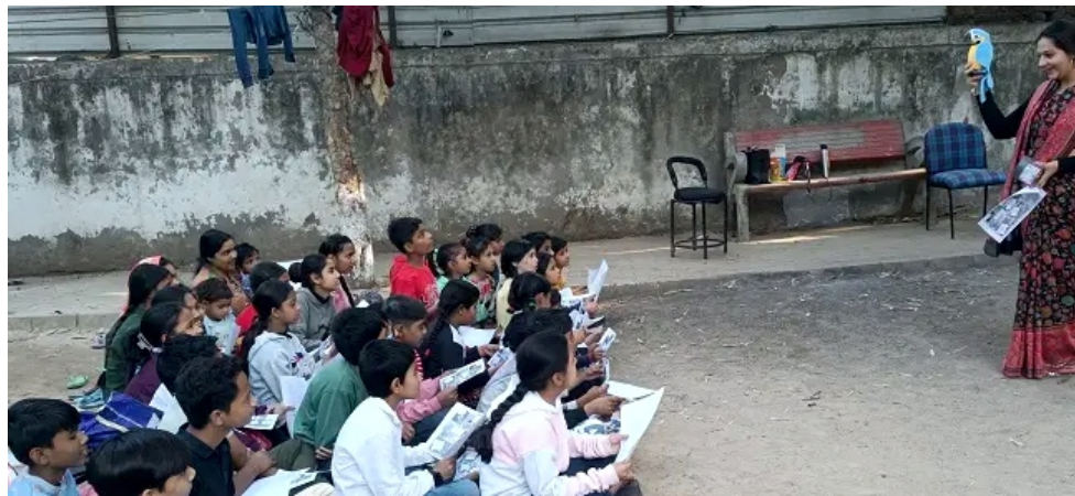
Community Outreach : Bal-Uday and the Legal Aid Clinic, School of Law, Galgotias University

The Centre for Post Graduate Legal Studies, School of Law, Galgotias University, organized a one-day online workshop on "Research Methodology: Tools and Techniques in Legal Research." Designed for LL.M and PhD scholars, the workshop