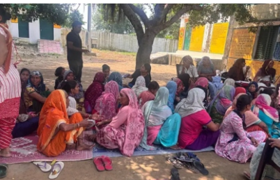
Community Outreach Program Campus Classroom

These initiatives not only offered immediate relief but also promoted values of compassion, unity, and solidarity. Through these charitable efforts, Galgotias University reinforced its dedication to creating socially-conscious individuals who understand the importance of giving back. The events helped cultivate a culture of kindness and long-term impact, ensuring that the university's mission of fostering positive social change resonates within the broader community.