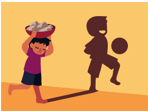
Community Outreach Program Campus Classroom

Galgotias University has launched impactful Community Outreach Programs to empower local communities and address pressing social challenges. These initiatives focus on skill development, healthcare access, and education, fostering long-term social progress. Vocational training workshops have been introduced to equip residents with employable skills, enhancing their opportunities for stable livelihoods. Free medical check-ups were organized, providing essential healthcare services to underserved populations, ensuring better health and well-being within the community. In addition, tutoring sessions for children were conducted, offering academic support to improve their educational outcomes. To ease financial burdens, school supplies were distributed to families, ensuring students had the resources they needed to succeed. These multifaceted programs reflect the university's commitment to sustainable development and its dedication to strengthening ties with the community. By addressing immediate needs and fostering self-reliance, Galgotias University continues to empower individuals and contribute to a brighter, more equitable future for all.