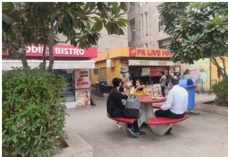
Accessible & Affordable Nutritious Food Campus Cafeteria