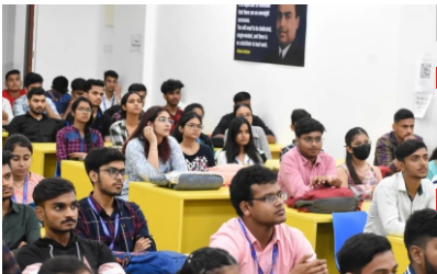
Study @GalgotiasUniversity Campus Classroom

Programs Offered - Doctor of Philosophy (Ph.D.) in Environmental Sciences M.Sc. in Sustainability