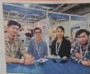
प्रोजेक्ट की जानकारी देते छात्र।