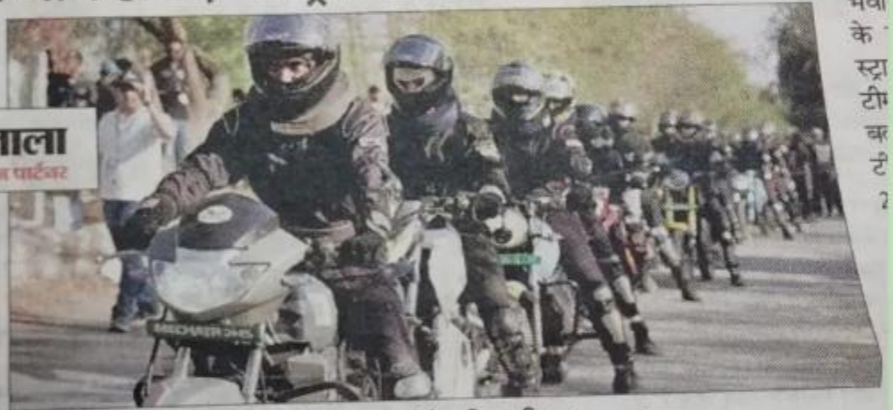
बाइक रेस में भाग लेते प्रतिभागी।

अप्रैल को होगा। वर्ष 2023 में शुरुआत के बाद से इसका प्रतियोगिता का संचालन छात्र करते हैं। जिसमें वाहन निर्माण से लेकर डिजाइन और परीक्षण तक का पूरा दायित्व