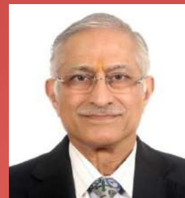
JUSTICE J.R. MIDHA