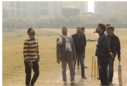
Tossing the coin for Finals