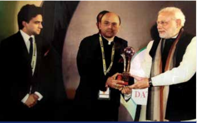
Mr. NARENDRA MODI, Prime Minister of India, conferring the DQ ICT AWARD to Galgotias University