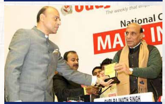
Shri RAJNATH SINGH Hon'ble Former Union Home Minister conferring award at Galgotias University