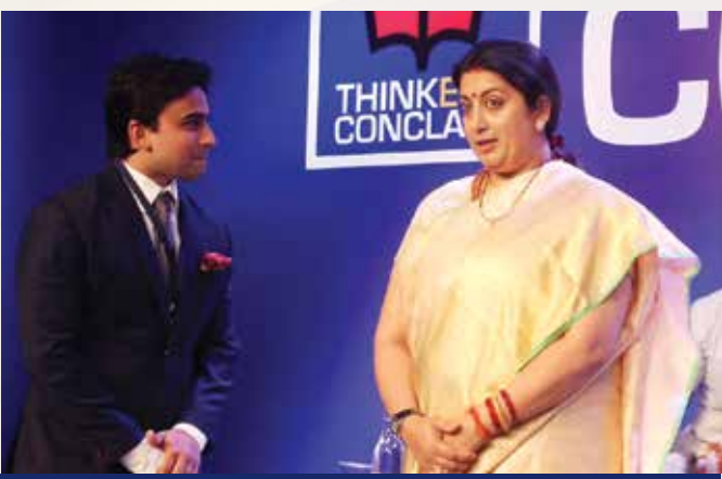
Shri Dhruv Galgotia, CEO, Galgotias University with Hon'ble Smt. Smriti Zubin Irani, Union Cabinet Minister