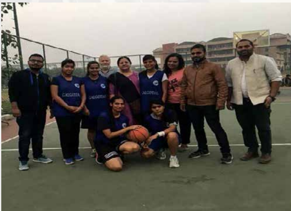
Girls Basket Ball Team with Faculties, Coach and Dean, SOL G.U.