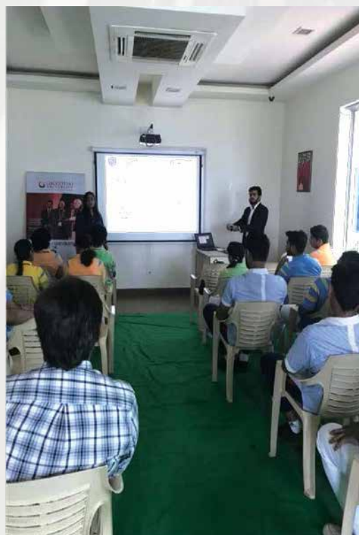
Anti Ragging Drive @ Galgotias University

It was propagated that simultaneous efforts are also required to target the youth, especially the students studying in schools, so as to build a society fully aware of human rights issues. Among the public functionaries, the police are the most important machinery as majority of the complaints of violation of Human Rights