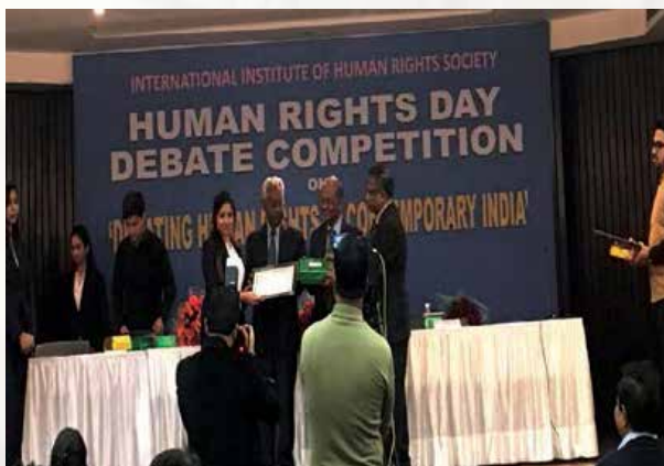
Student of SOL, receiving Award @ Human Right Day Debate Competition

LDS regularly conducted Debating Sessions (Practice) on various topics with the Secretary at the helm and the support of faculty members who were ever-ready to guide and adjudicate these events. These were intensive sessions inculcating a thorough tete-a-tete on contemporary issues infusing empirical skills.