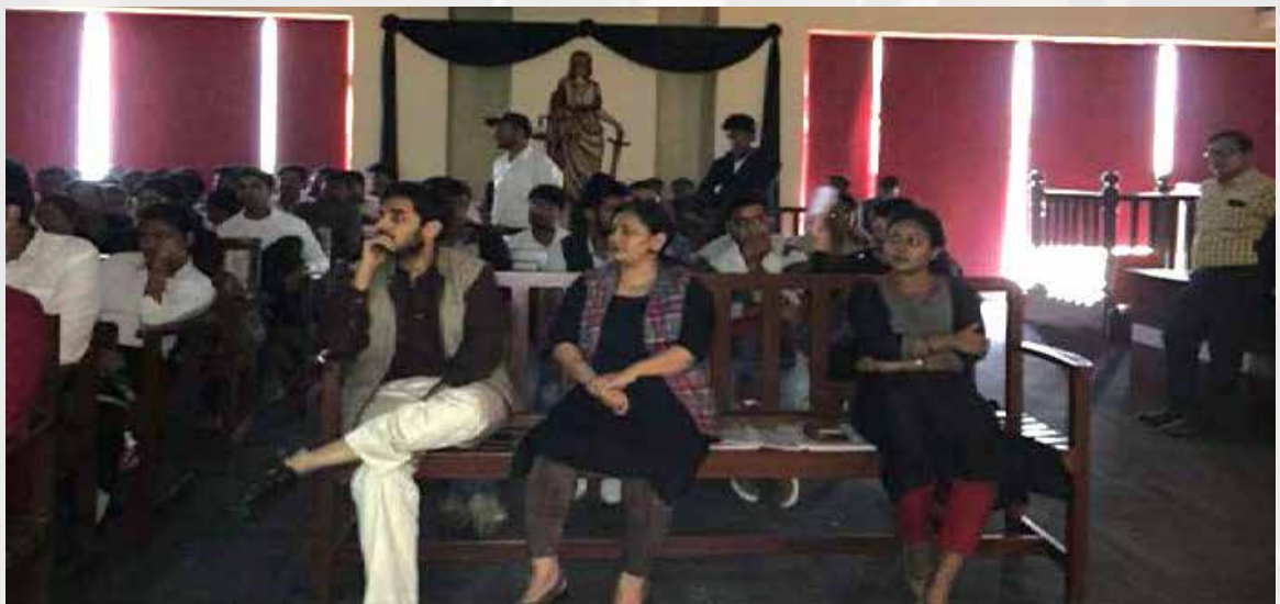
Participants in Workshop on Moot Court