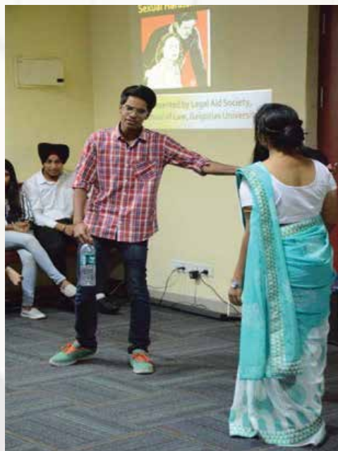
Skit on "Sexual Harassment" by Student of SOL

Exploring these topics, create a safe place for students to examine, discuss, challenge and form their own opinions and values. The knowledge and respect of rights that students gain from this, combined with understanding, respect and tolerance for difference, can empower them to tackle prejudice, improve relationships and make the most of their lives. In our ever more diverse and challenging society, it becomes more important to instill young people with these positive and open-minded attitudes.