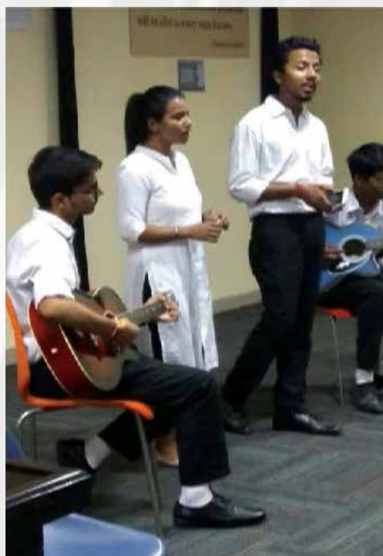
Cultural Event in Sardar Patel's Anniversary Celebration @ SOL