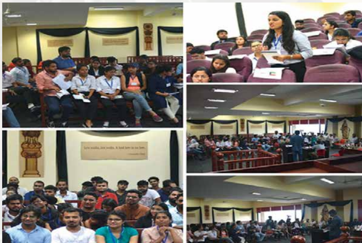
Students actively participating in Debating Session @ SOL