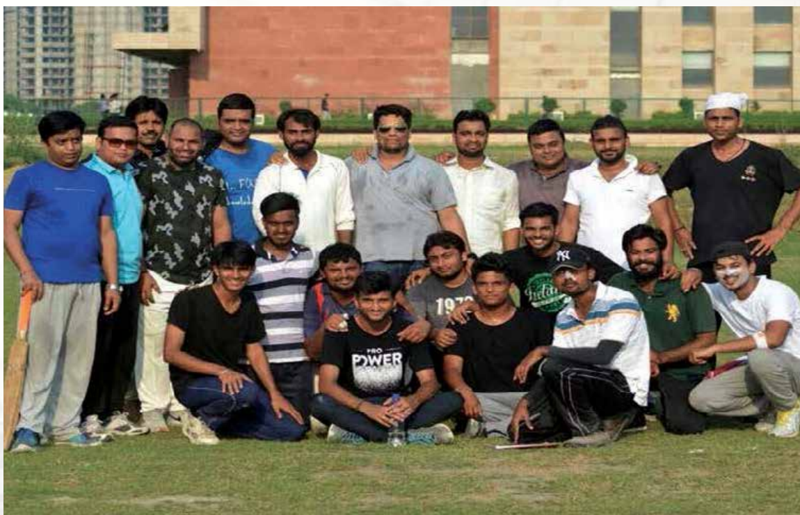
Faculties & Students, Cricket Match at SOL, G.U.