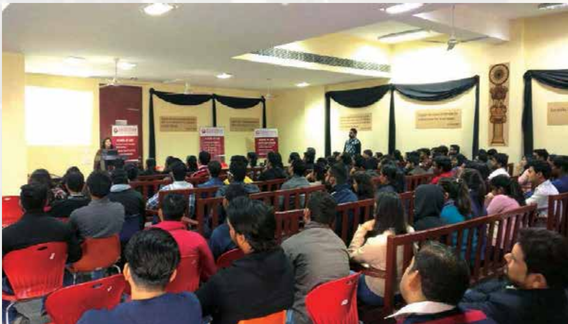
Workshop on Westlaw Accessing for Legal Research