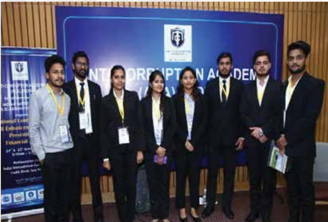
Students Participants, Presented Research Paper @ Anti-Corruption Academy (ACA)