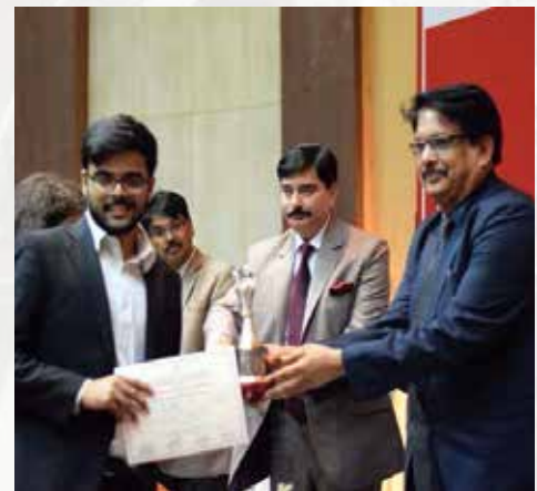
Certificate Awarded To the Winners, NLU Odisha