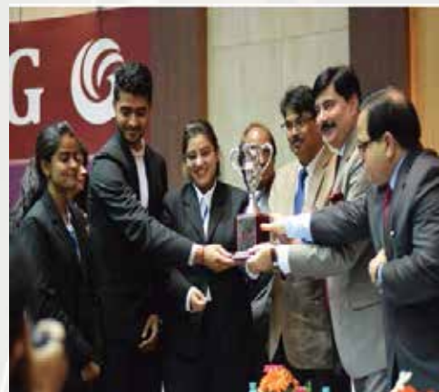
The Runner's Up Trophy