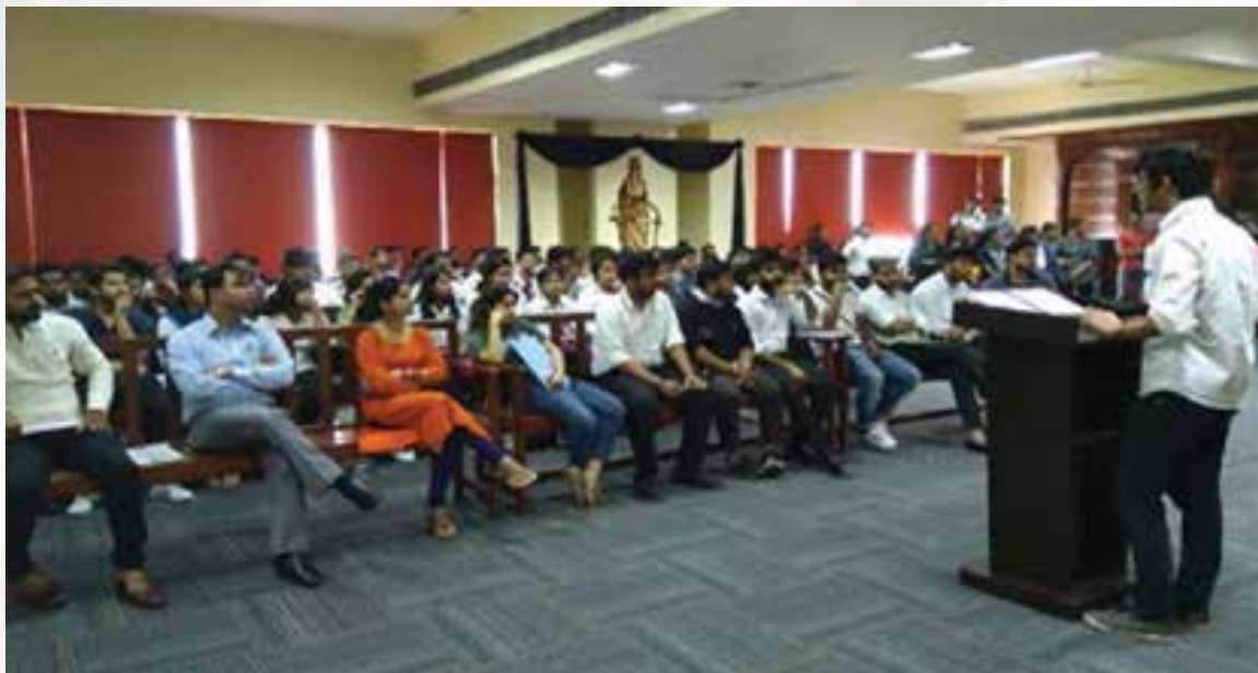
Celebration of Sardar Patel Anniversary @ SOL

On the momentous occasion of Sardar Vallabh Bhai Patel's 142nd Birth Anniversary, School of Law, Galgotias University organized an event of unity in diversity on this warm autumn afternoon. The school organized various events in order to celebrate the unsung hero of India.