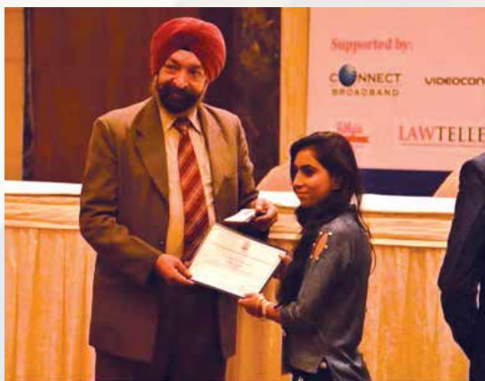
Students of SOL @ “# Leave No One Behind”