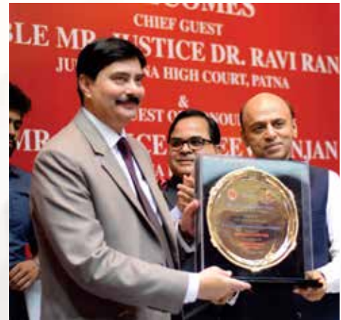
Hon'ble Chancellor Presenting The Memento To The Chief Guest