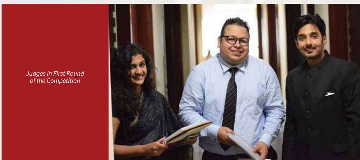
Judges in First Round of the Competition