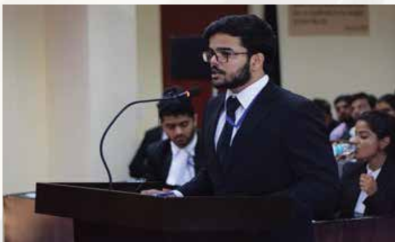
The Speaker Participant at Moot Court Competition