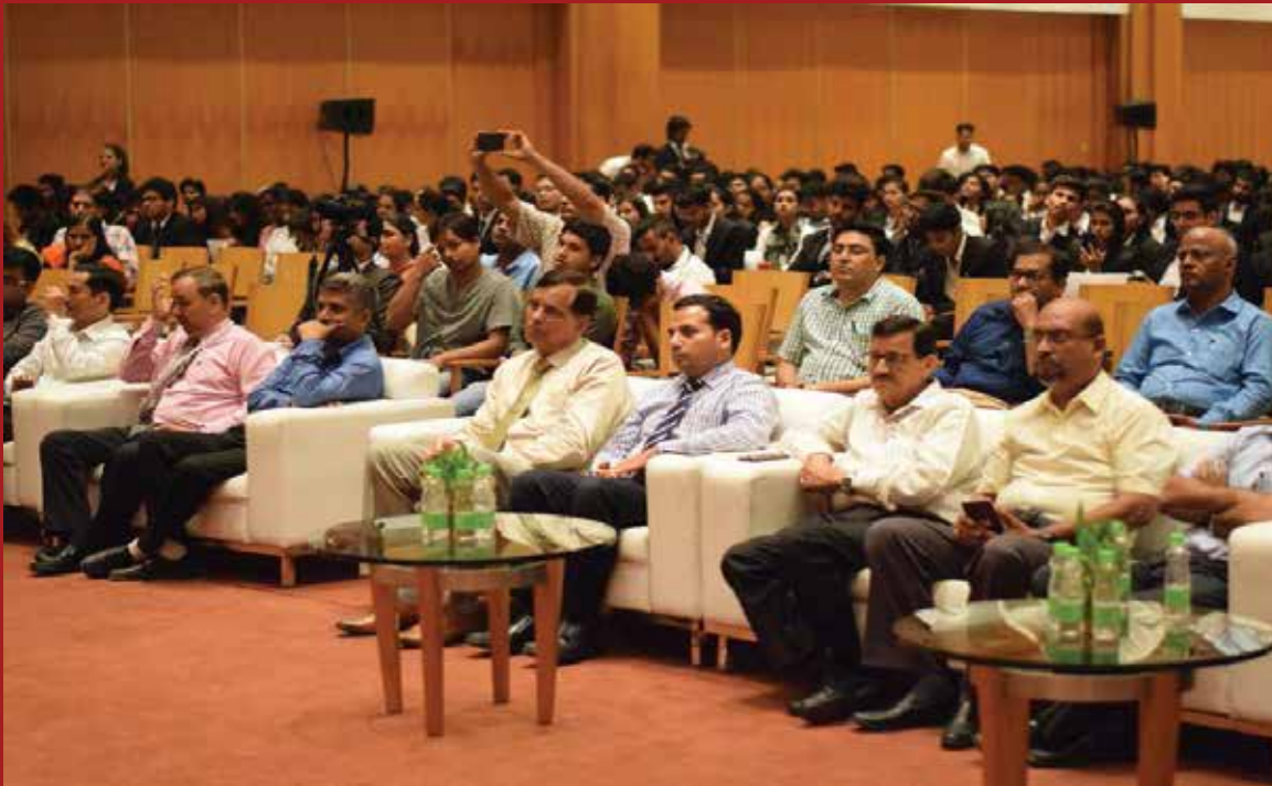
@ Inaugural Function