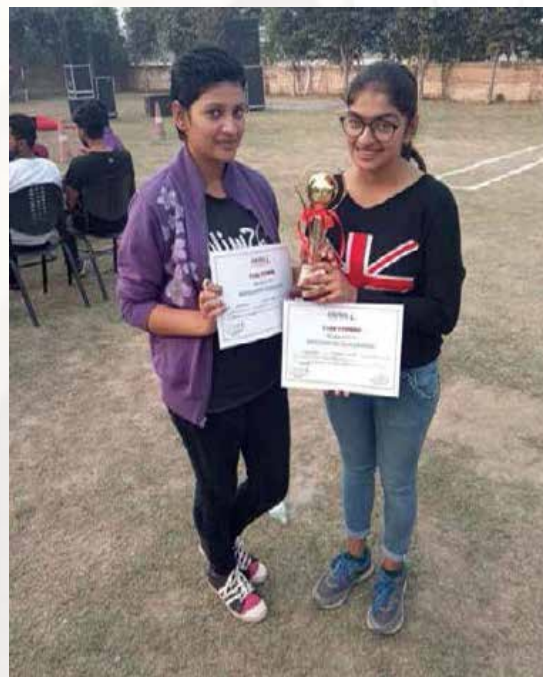
Winner of Badminton