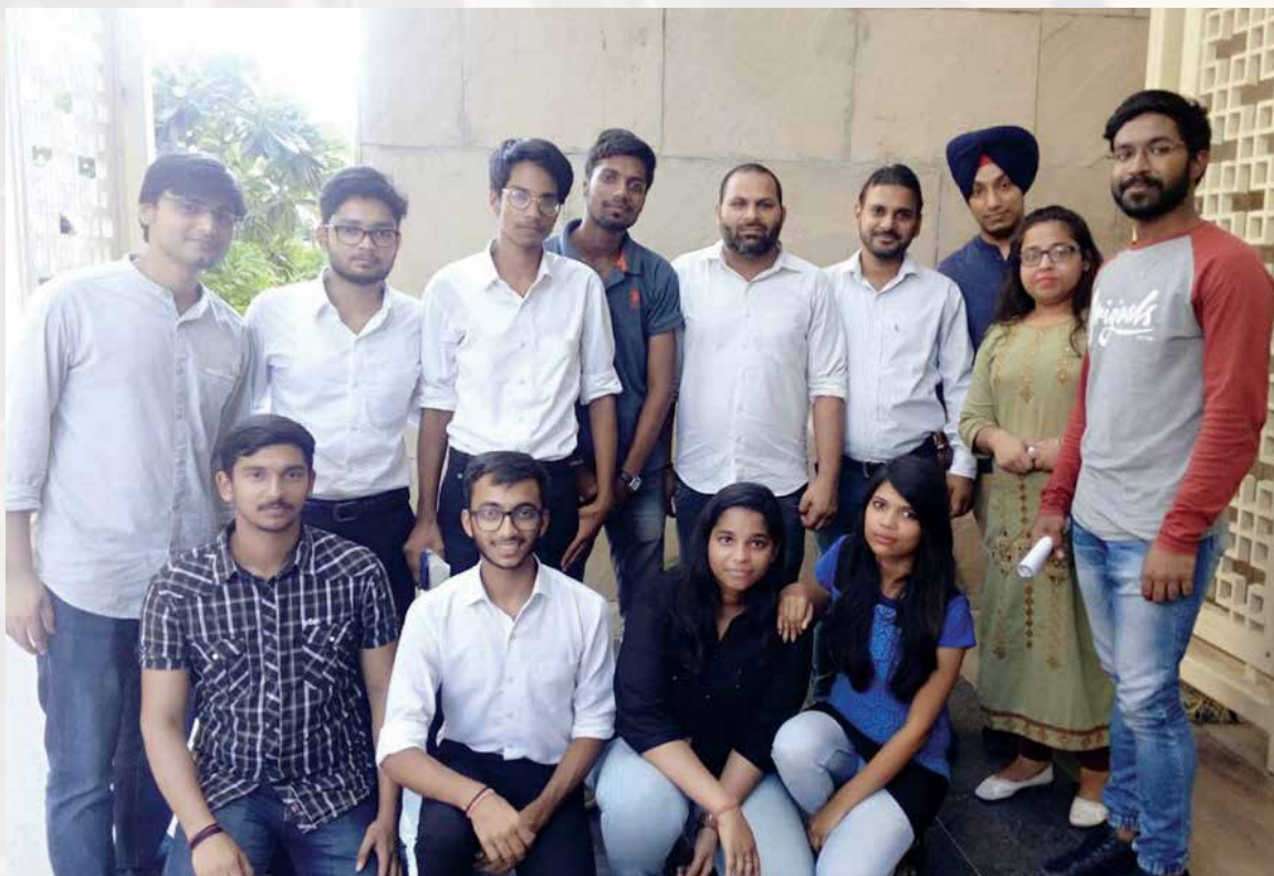
Students Anti Ragging Drive at Galgotias University