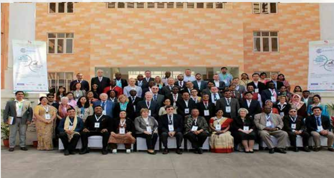
Dignitaries @ Global Deans Forum