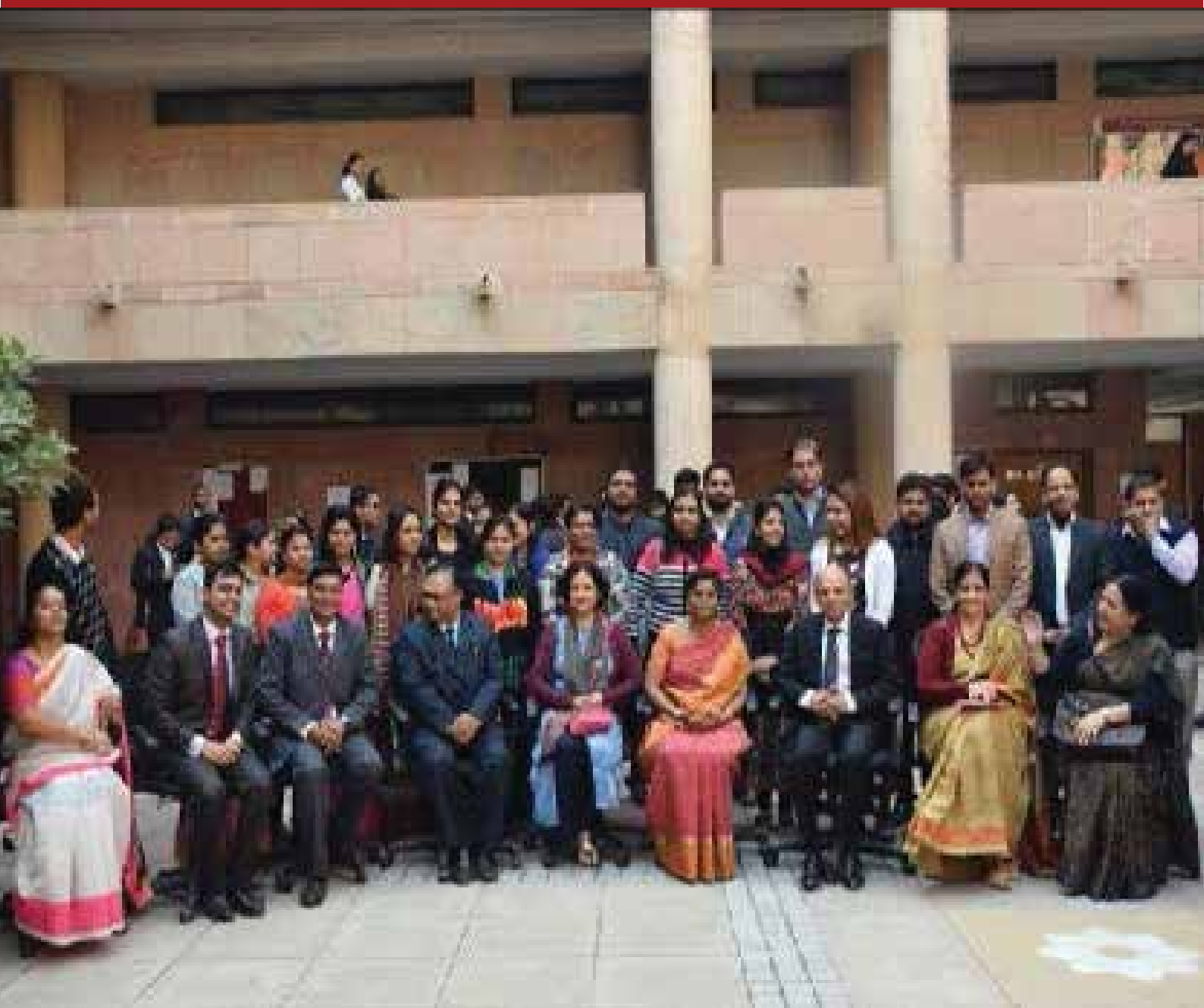
Group Photo @ National Workshop on "Emerging Issues in Intellectual Property Rights"