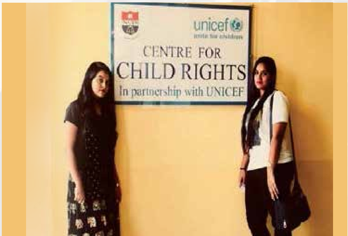
Students @ Centre for Child Rights UNICEF

Research paper presentation on Triple Talaq, at NLSIU Bangalore. Parliamentary Debate & Debate at Indian Law Institute. Indore, National seminar on surrogacy: ethical, legal, socio economic issues at IMS Dehradun.