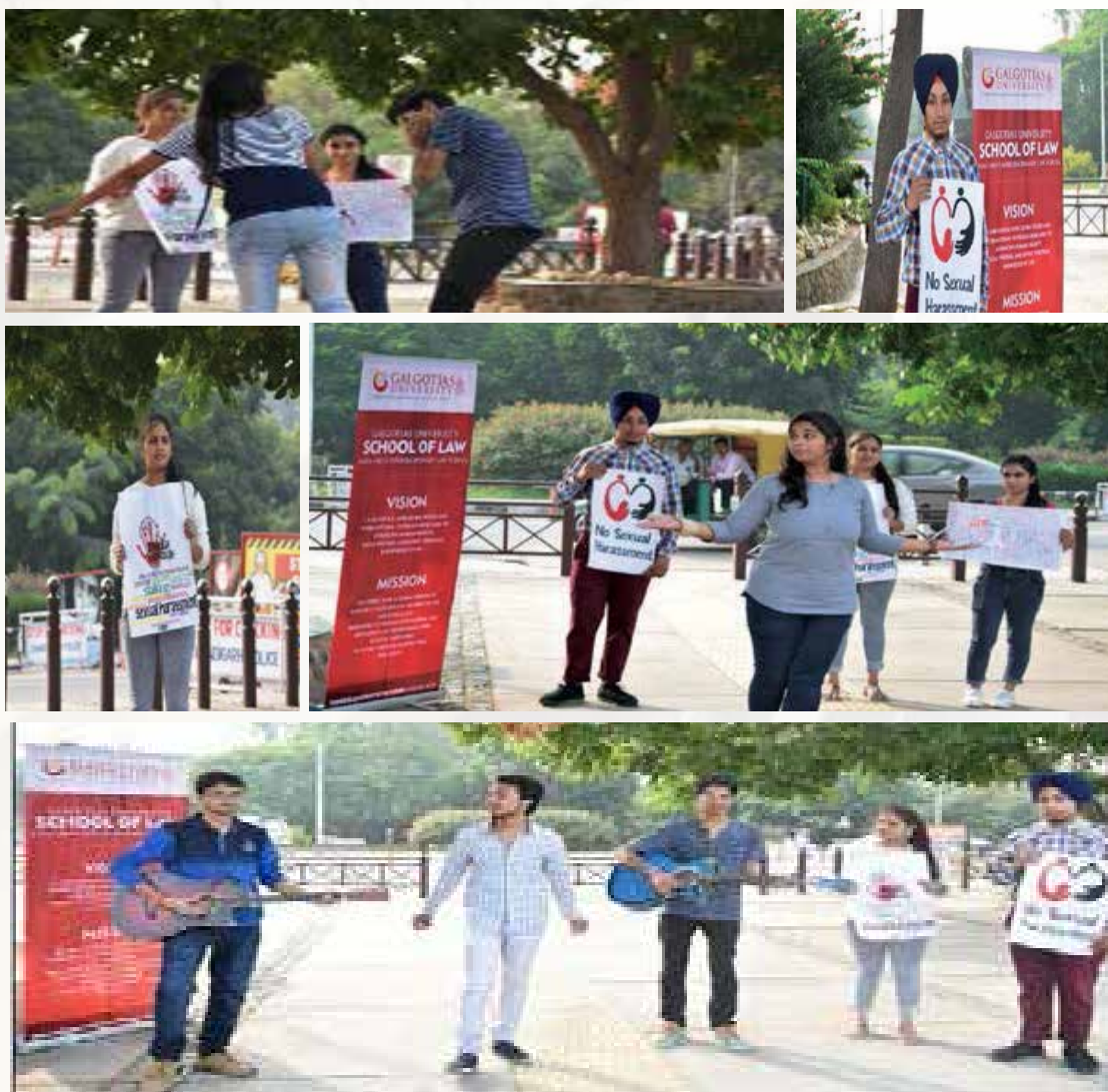
Students of SOL Creating Legal Awareness on "Rights relating to Prevention of Sexual Harassment" by Performing Street Play