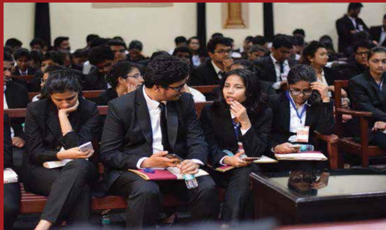
Assorted Sessions of Rounds @ BCI MOOT COMPETITION