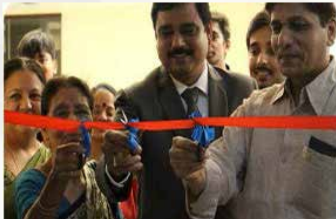
Inauguration of the CSIL @ SOL

The CSIL has also opened an International Law Students Association (ILSA) chapter, which will bring many benefits for the students relating to exposure to the discipline through events, discounts in registration and access to an international network of professionals, law students, materials, and resources.