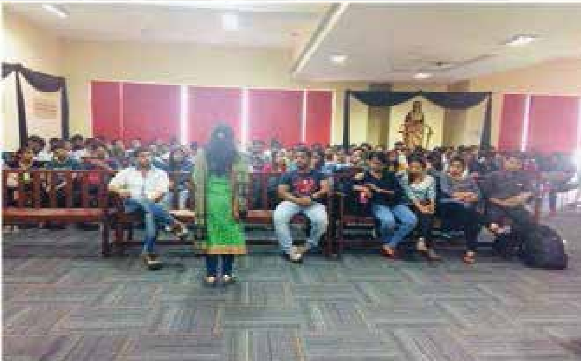
Movie Screening and Review of critically acclaimed movie "Newton"