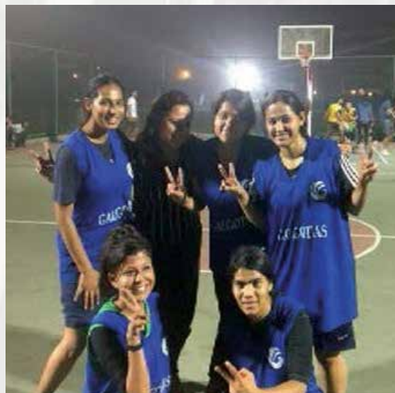
Girls Basket Ball Team, Winner