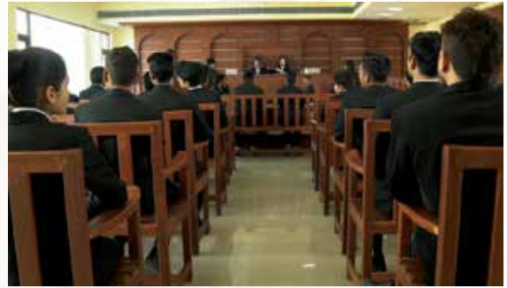
Students in Intra Moot Court Competition @ Moot Court Hall, SOL