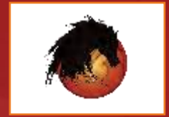
Galgotias Riding Club