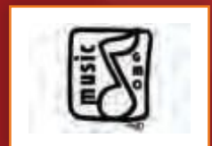
Note Veda - The Music Club