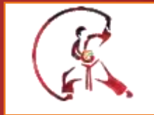
Martial Arts Club