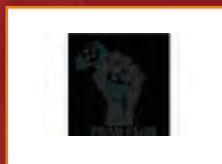
Galgotias Gaming Club - F.R.A.G.