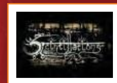
Scintillations The Fashion Club