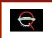
Quizita Mavens - Galgotias Quiz Club