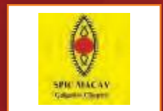
Spic Macay Club