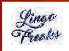
Lingo-Freaks-The Literary Club